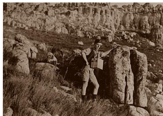
BERT HOWES ZS6HS