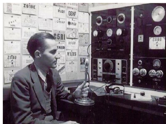
LEN ZS1AU 1938